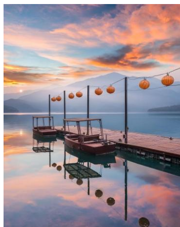
04~06 日月潭蔣公碼頭_水彩 8 開 (日期：1/27、2/3、2/10 學費：$1,200)