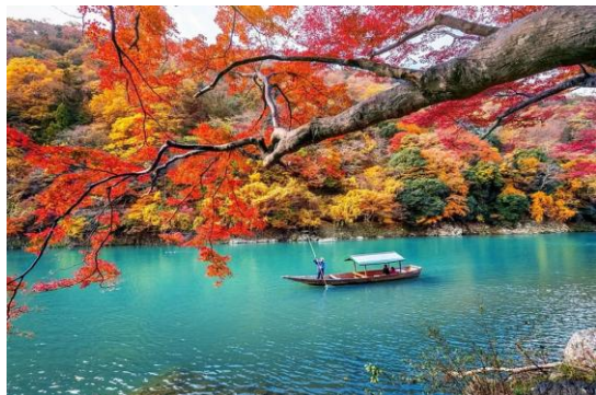
01~03 日本嵐山紅葉_水彩 8 開 (日期：1/6、1/13、1/20，學費：$1,200)