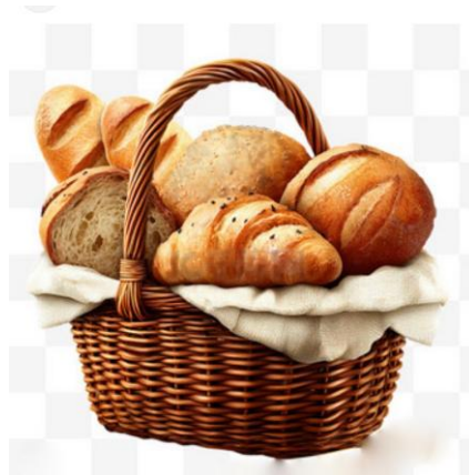
10~12 麵包籃_水彩 8 開 (日期：3/17、3/24、3/31，學費：$1,200)

水彩班班長：許惠文， aswc202405@gmail.com ，電話：02-27898207