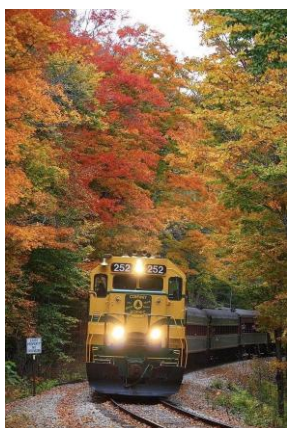
07~09 秋天的電車_水彩 8 開 (日期：2/24、3/3、3/10，學費：$1,200)