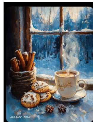
09~12 咖啡與甜點_油畫 6F (5/18 起共 4 堂，共 1680 元)

游藝社畫作賞析網址： https://www.facebook.com/minfeng.jong