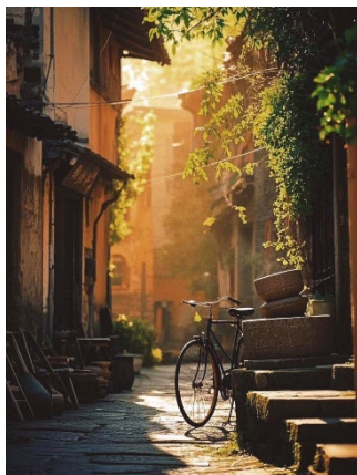
05~08 舊城老巷午後斜陽_油畫 6F (4/20 起共 4 堂，共 1680 元)