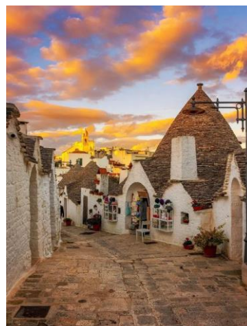
09~12 義大利阿爾貝羅貝洛蘑菇村_水彩 4 開 (日期：6/17、6/24、7/1、7/8，學費：$1,600)

游藝社幹事：廖慧如，Nereid.Liao@twgrid.org，電話：2789-8373