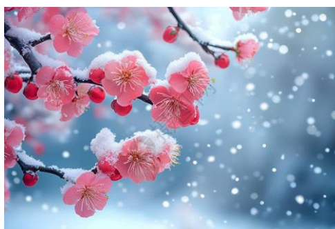
04~06 紅梅_水彩 8 開 (日期：5/13、5/20、5/27 學費：$1,200)