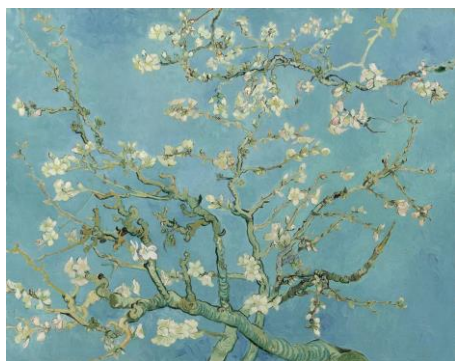
07~08 梵谷《盛開的杏花》_水彩 8 開 (日期：6/3、6/10，學費：$800)