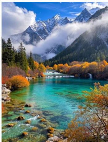
01~03 九寨溝_水彩 8 開 (日期：4/22、4/29、5/6，學費：$1,200)