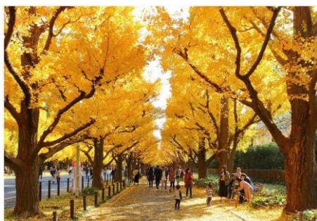
07~09 秋天明治神宮外苑銀杏大道 (日期：9/30、10/7、10/14，學費：$1,200)