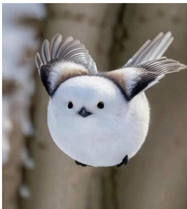
01~03 銀喉長尾山雀_ (日期：8/19、8/26、9/2，學費：$1,200)