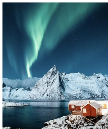
10~12 挪威羅弗敦群島極光 (日期：10/21、10/28、11/4，學費：$1,200)

水彩班班長：許惠文， aswc202405@gmail.com ，電話：02-27898207