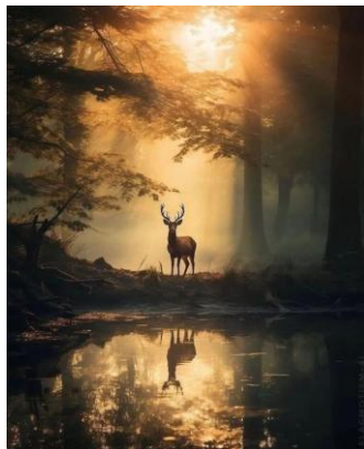
04~06 一頭鹿兒從樹林深處踏出 (日期：9/9、9/16、9/23 學費：$1,200)