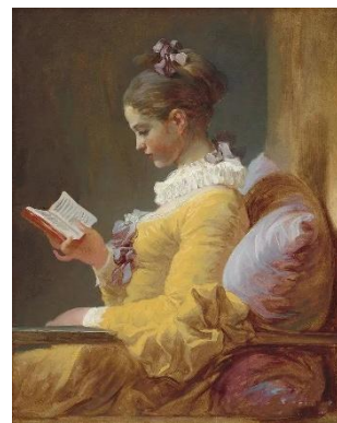
09~12 弗拉戈納爾《讀書女孩》82x 65cm_油畫 6F

(8/11、8/18、8/25 及 9/1，共 1520 元) (9/8、9/15、9/22 及 10/13，共 1520 元) (10/20、10/27、11/3、11/10，共 1520 元)