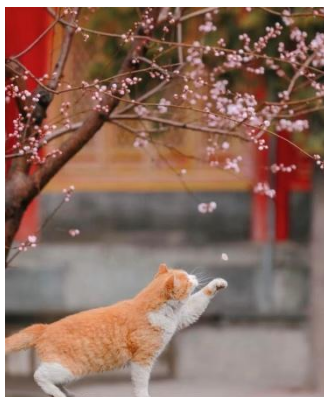
05~08 貓兒&春花_油畫 6F